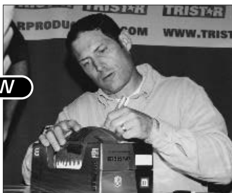
2005 Pro Football Hall of Fame inductee Steve Young was one of the most popular signers in an impressive autograph lineup at the Tristar show in San Francisco.